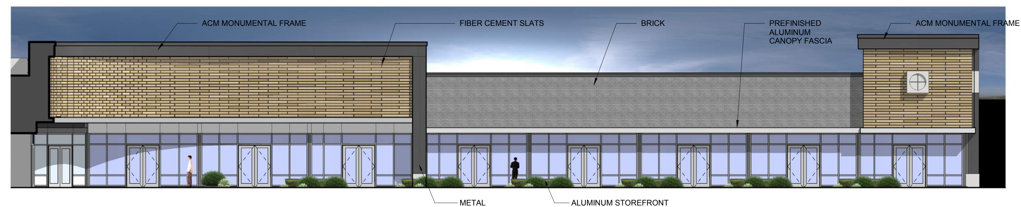
NORTHEAST BUILDING ELEVATION SCALE: 3/32" = 1'-0"