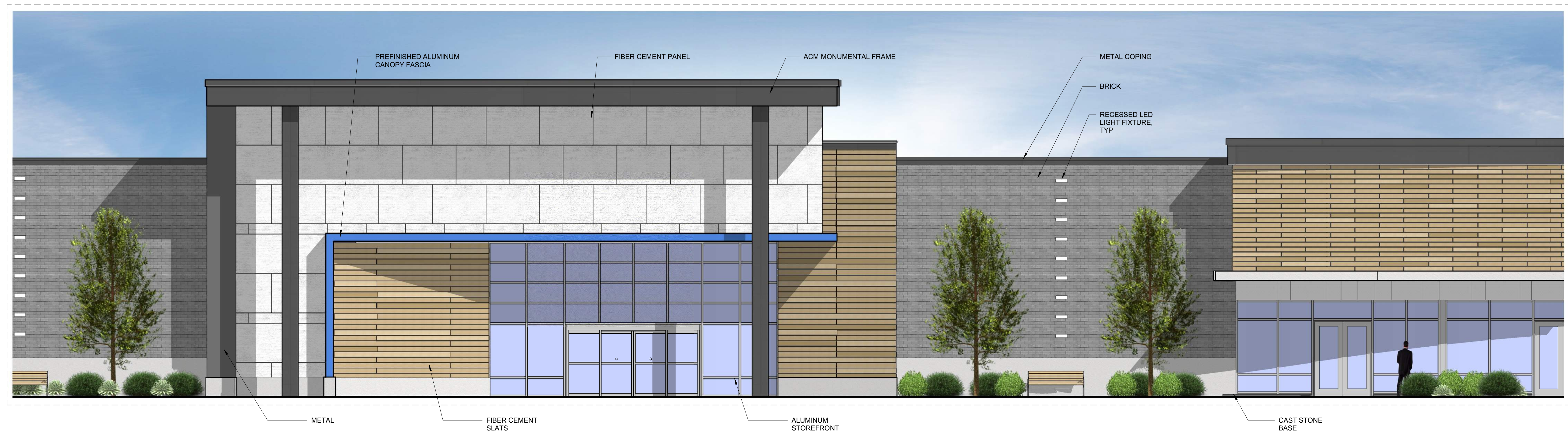
ELEVATION SCALE: 3/16" = 1'-0"